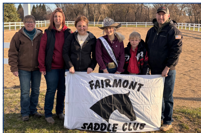
The Fairmont Saddle Club received $500 grant for their arena gate project.