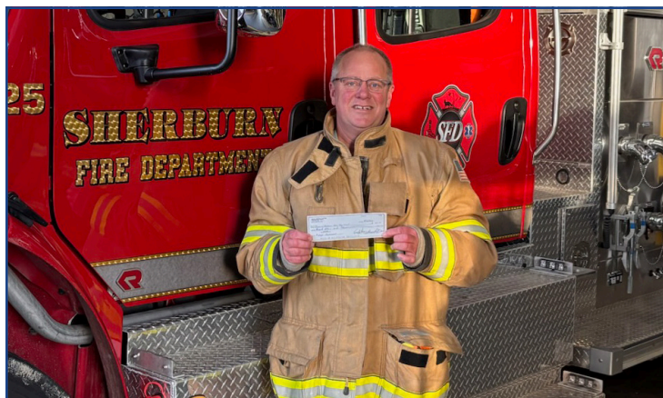
The Sherburn Fire Department received $1000 grant for pager replacement.