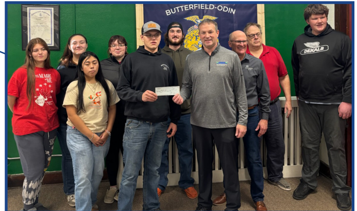
Butterfield/Odin High School FFA received $1,500.00 towards operations.