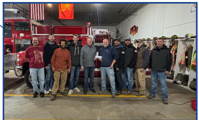
Storden Fire Department received $1500.00 towards a grass rig pumper replacement.