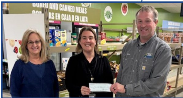
Watonwan County Food Shelf received $250.00 towards a Thanksgiving blessing.